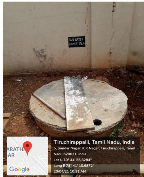
College Block I