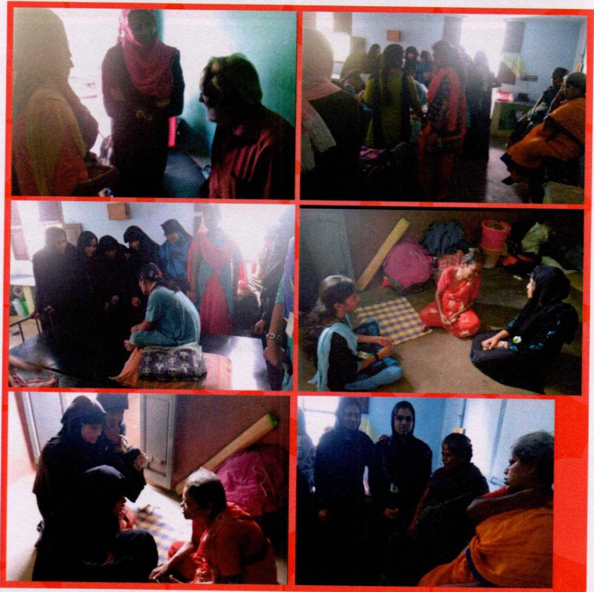
Our YRC Students interacting with them.