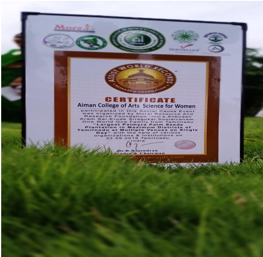
WORLD ASSIST RECORD for AIMAN COLLEGE.