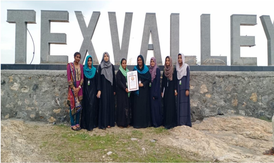
AIMAN YOUTH EXNORA being honoured for its active participation.