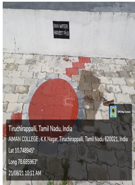
New Hostel Building