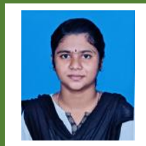
A.APSARA ROSE DELINA III BCA