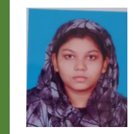
I.SANOFAR NISHA III BA-Eng