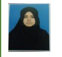
S. JAINATH III B .COM