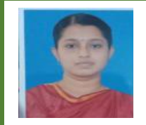
RAKSHA A PRABHU III B .COM