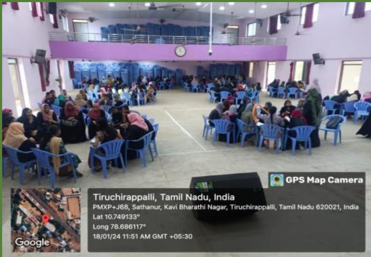
ROUND 1 Started by our Students