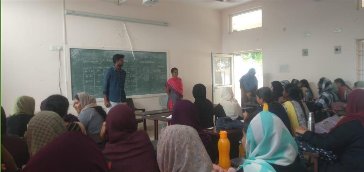
Students Clarifying their doubts from Employment Officer, Trichy Training 3 : Career Guidance Program on 29/02/24 by VDart Technologies Pvt Ltd, Trichy