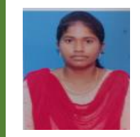
NANDHINI III BA-Eng