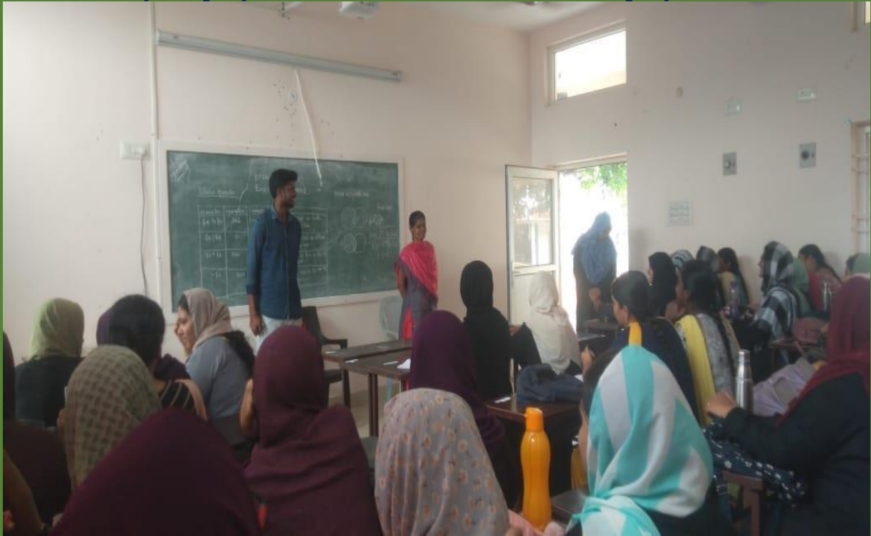
Students Clarifying their doubts from Employment Officer, Trichy