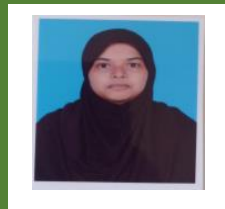
A.AFRIN III BA-Eng